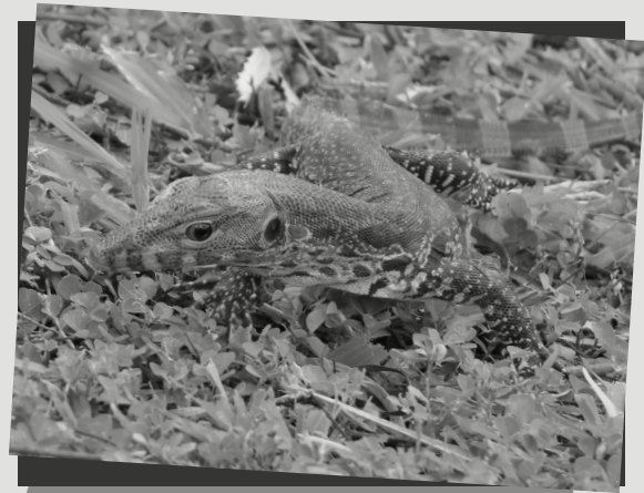
Malayan Water Monitor

Often hiding amongst the leaf litter in the forest, this lizard can sometimes be seen basking in sunlit areas of the forest.