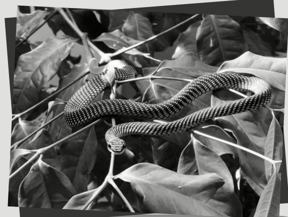
Paradise Tree Snake

Commonly spotted even in open areas, you can sometimes see this lizard doing push-ups to attract nearby females.