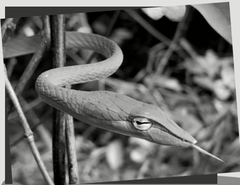
Oriental Whip Snake

Completely green, this snake hides itself very well against the leaves, ambushing prey such as small lizards and frogs.