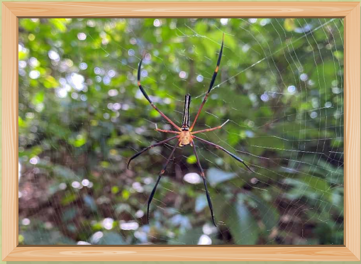
GOLDEN ORB-WEB SPIDER

One of the largest spiders you can spot in the forested areas around Sentosa, it can make a strong web that spans up to 1m in width and has a golden sheen.